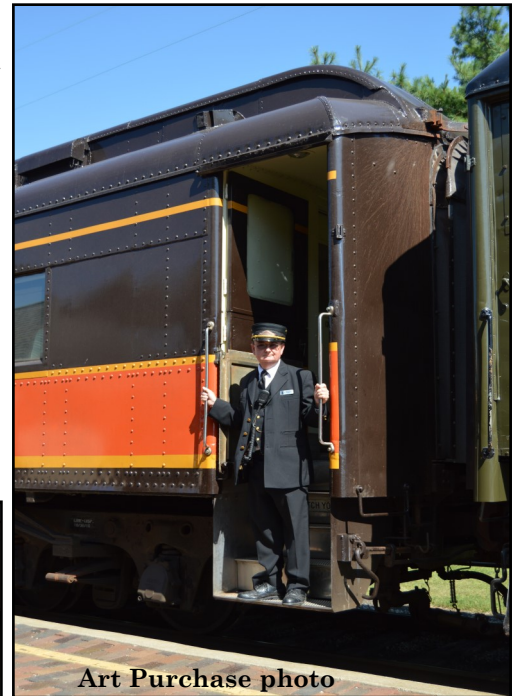
Art Purchase photo

IC Coach #2612 This car was used during Polar as usual, and while we repaired one external leak in steam heat plumbing on the outside of the car, a new leak has appeared inside the car, as well as a new one outside, which has rendered the overhead heat non-functional. This past Polar season was moderate enough weather-wise for there to be no need for the overhead heat, but that will not always be the case. To get at the offending external leak will require jacking the car off the truck to access the piping, so we are also considering removing the overhead steam heat coil and replace it with the electric equivalent, as that would remove the need to deal with the balky steam control to the overhead, which would frequently stick open, causing the car to overheat. As I've noted before, parts for the steam heat components of the cars are no longer available, causing us to rob one car to maintain another, which of course, is an unsustainable situation.