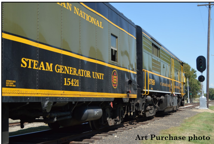
Art Purchase photo

CN #15421 This past season we determined we did not have sufficient time to get the entire generator set swapped out for the new one, but we did get the electrical system rebuilt to handle the power output of the new genset. This required much work in the car, under the car, and in an old battery box. Jeff Tillman fabricated and installed new HEP end-of-car brackets, and ran new conduit were required over the trucks, and into the car to contain new wiring. He also pulled all the new 4/0 copper wire needed to handle the new genset, as well as connecting it to the new switchgear in the battery box, and connecting the new HEP connectors on the end of the car. Brian Downing them spent a couple of looonnnnggg nights hooking up