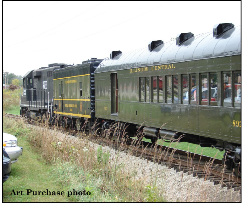
Art Purchase photo

This car has also developed an additional steam leak in the coach compartment. Like the previously noted one, the way the car is plumbed for heat, we can shut off that portion of the loop and not lose all the heat on that side of the car. Fixing the leak will be somewhat tedious, requiring removal of a number of seats and bases to be able to access the length of pipe that has failed. This car is lobbying to be converted to electric heat!